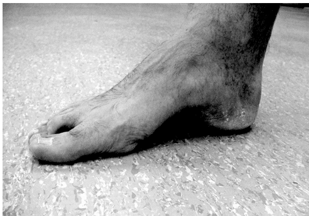
Figure 1. Photograph of the typical cavus foot featuring an excessively high medial longitudinal arch and clawing of the digits.

such as these are thought to be associated with abnormal pressure loading on the plantar surface of the foot. 3